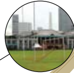
THE ESPLANADE THEATRE BY THE BAY