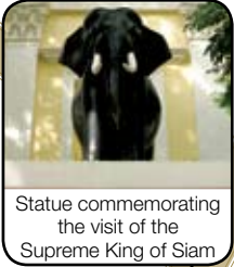
Statue commemorating the visit of the Supreme King of Siam