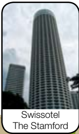
Swissotel The Stamford